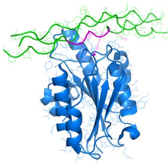
Fig. 2 In a collagen-GAG scaffold that induces organ regeneration, specific motifs (cyan) on the collagen (green) scaffold surface bind specifically with integrin segments (blue) on the membrane of contractile fibroblasts (myofibroblasts).