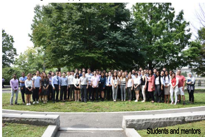
Students and mentors

Underrepresented minority students and students from institutions with limited STEM research opportunities are encouraged to apply.